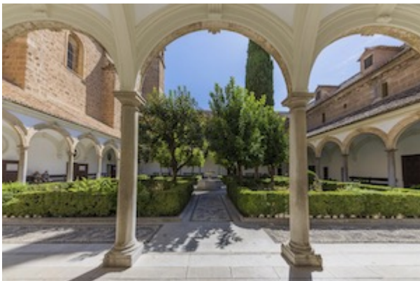
Little cloister. Monastery of the Cartuja in Granada