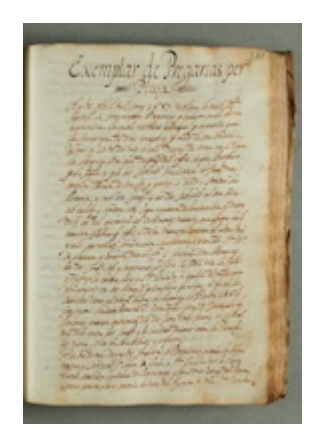
El Manual del Cabiscol, fol. 145

La Nouvelle description de la fameuse ville de Barcelone (detalle), Louis Boissevin, 164[5]